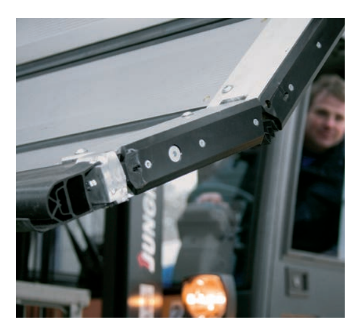
A milestone in economy and safety: The EFA-ACS® active crash system prevents expensive damage, unnecessary downtime and a lot of hassle!

In the event of a collision, the detachably connected laths are pushed out of their guide rails, undamaged. An inductive sensor system records this and, while slowly retracting the door upwards, safely and properly restores the door blade and frame to their proper condition.