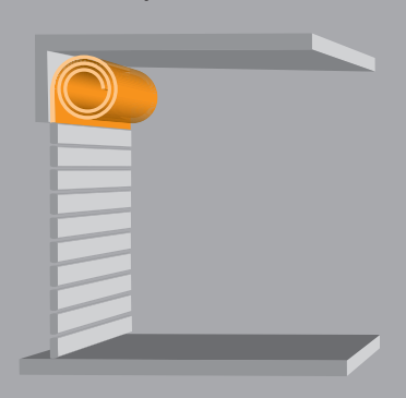
The round spiral is the standard and is the ideal solution if there is enough space above the door.