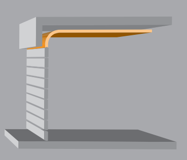
The low header model is used for example in underground parking and car parks.