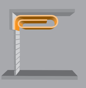
Oval, and thus space-saving designs are used in restricted structural conditions.