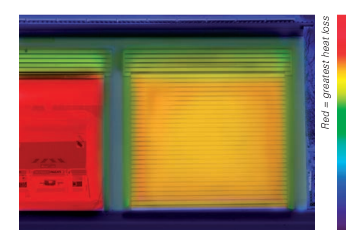
This thermal image of a conventional roller door clearly shows the loss of heat to the outside.

The EFA-SST<sup>®</sup> Essential was specifically designed for areas with average traffic levels in which medium opening and closing speeds are sufficient. The focus here is not on the speed, but rather on the high quality and the enormous resilience of the EFAFLEX spiral door.